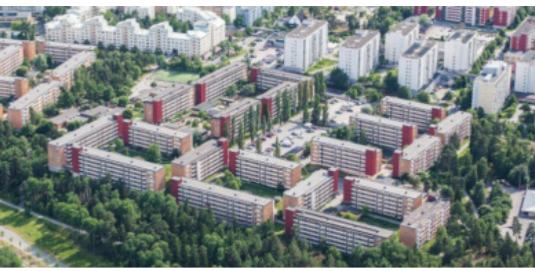
The Swedish real estate space rebounded during the quarter and D Carnegie was one of the top performers in Q3.

The general conditions for real estate continue to be favourable despite rising interest rates, primarily due to healthy and expanding economies in selective markets. In these markets, of which Europe and the US are good examples, underlying EPS and net asset value growth remain positive, supported by robust operating performance, falling financing rates and deleveraging. With some exceptions, like the Hong Kong residential market, yield spreads are still very wide seen from a historical context. An increasing trend of capital management initiatives, like share buy backs and hiked dividends are also positive.